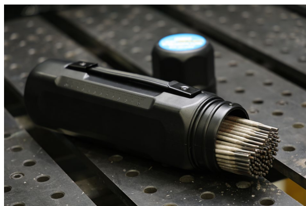
Integrated Carry Handle & Ruler