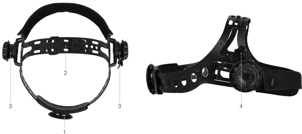
Figure 6-1 Harness Adjustment

To adjust the viewing angle position, release the two tabs (4) from the notches on each side to adjust the angle up or down.