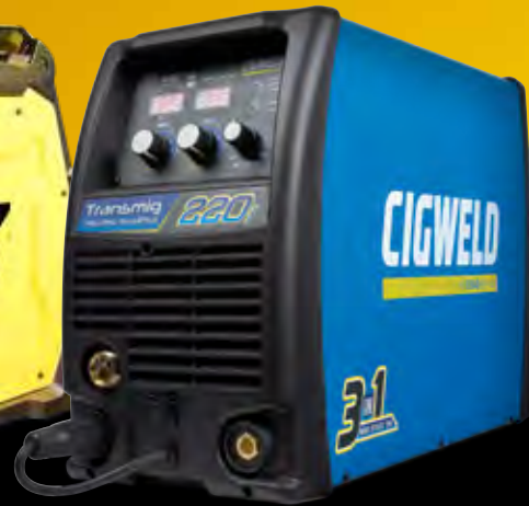
TRANSMIG 220i MULTI PROCESS INVERTER