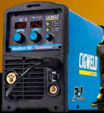
WeldSkill 185 MULTI PROCESS INVERTER