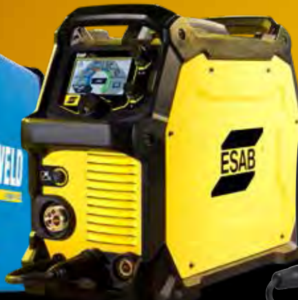
REBEL EMP 215ic MULTI PROCESS INVERTER