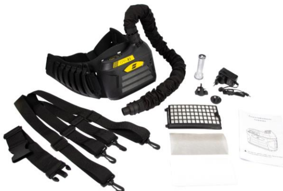
EPR-X1 PAPR System