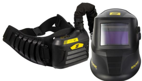
EPR-X1 with Savage A-40 Air Helmet