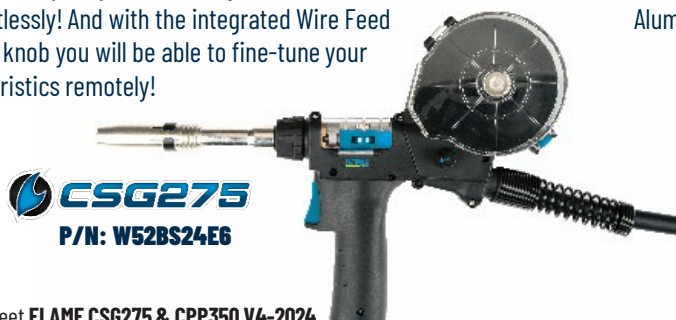
CSG275 P/N: W52BS24E6

Do you need weld inside the hull of a boat? With its 6-meter-long power cable you will have plenty of reach to get into the most remote areas and do your job effortlessly! And with the integrated Wire Feed Speed control knob you will be able to fine-tune your weld characteristics remotely!