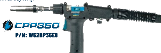
CPP350 P/N: W52BP36E8

With its Heavy Duty BZ36* Front End, the CPP350 can deliver an impressive duty cycle of 350A @ 45% & 300A @ 60% CO 2 , and 270A @ 60% & 350A @ 40% on Mixed Gas which allows the CPP350 to weld Aluminium all day long!