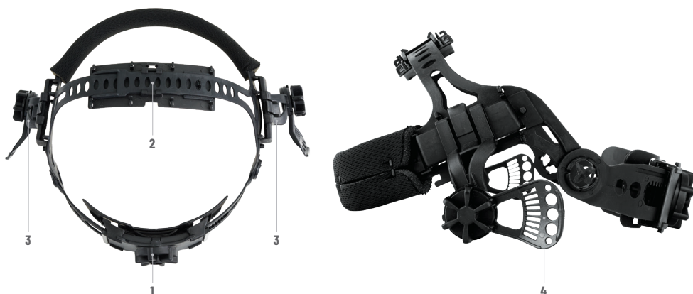
Figure 6-1 Harness Adjustment

To adjust the viewing angle position, release the two tabs (4) from the notches on each side to adjust the angle up or down.