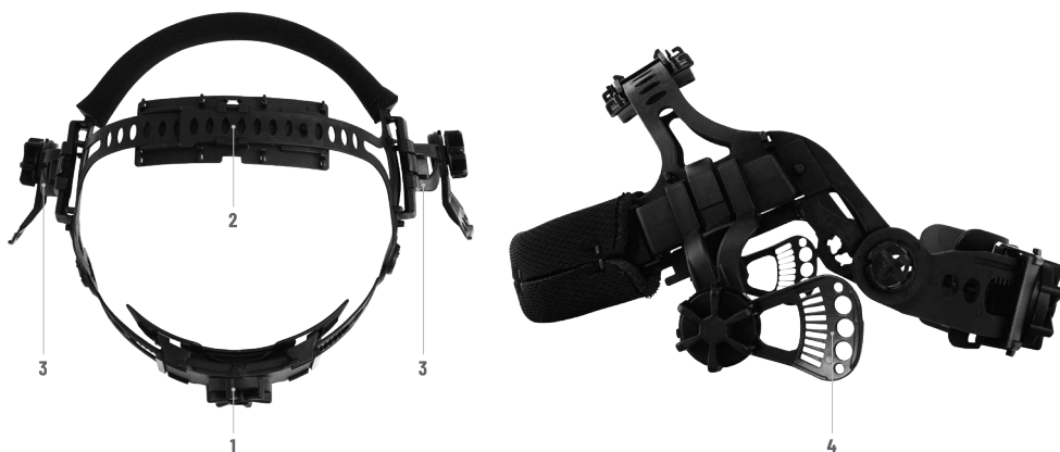
Figure 6-1 Harness Adjustment

To adjust the viewing angle position, release the two tabs (4) from the notches on each side to adjust the angle up or down.