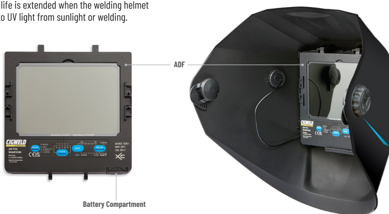
Figure 11-1 Battery Compartment

TIP: When the helmet is not in use, we recommend placing the helmet in a clear plastic bag (to keep it dust free) and storing on a shelf or rack facing a window with natural sunlight, the sun's rays will help extend the life of the batteries.