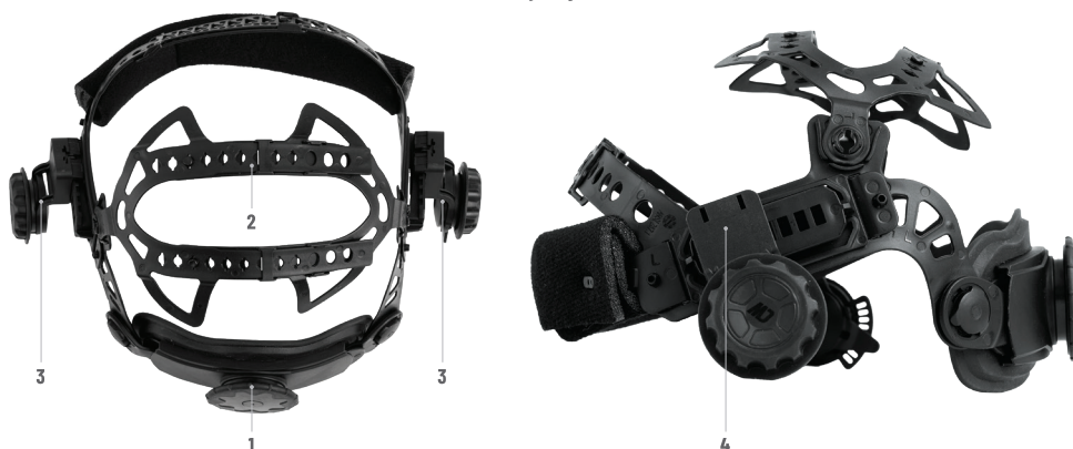
Figure 6-1 Harness Adjustment