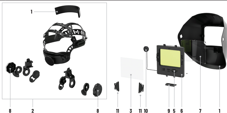
Figure 11-2 Exploded View of ArcMaster Auto-Darkening Welding Helmet

CIGWELD cannot be held responsible for the continuing performance of this Welding Helmet if non-genuine spare parts are used.