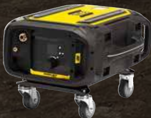
OPTIONAL ACCESSORY Wheel kit works with feeder horizontally or vertically P/N: 0446081880