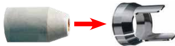
Shield Cup 1 Torch OTD9/8218