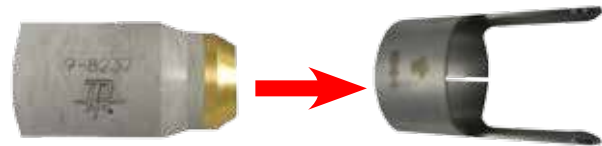
Shield Cup Body - Max Life 1 Torch OTD9/8237