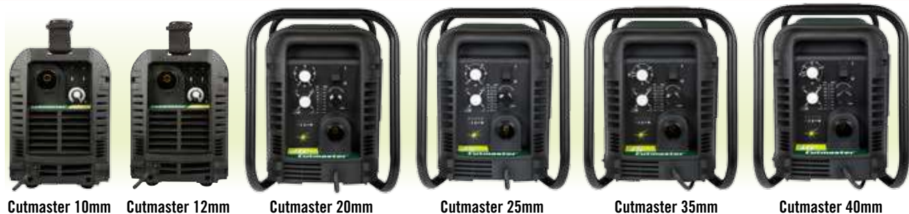
Cutmaster True Series Unit Specifications*

*Not available on the Cutmaster 10 & 12mm