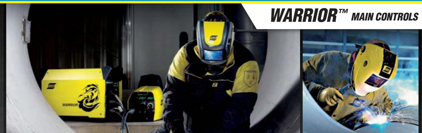
WARRIOR™ 400i CC/CV