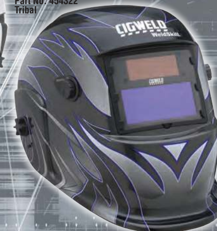
Part No. 454322 Tribal