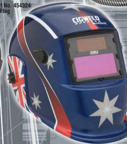
Part No. 454324 Oz Flag