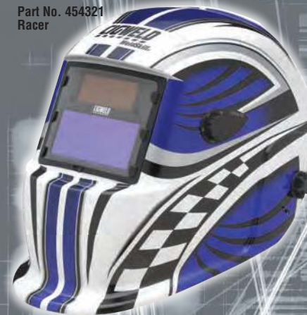
Part No. 454321 Racer