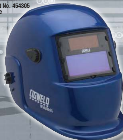
Part No. 454305 Blue